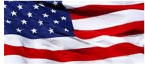
L1 - Visa

The L-1 category enables a U.S. employer to transfer an executive, manager or a professional employee with specialized knowledge relating to the organization's interests from one of its affiliated foreign offices to one of its offices in the United States. This classification also enables a foreign company which does not yet have an affiliated U.S. office to send an executive or manager to the United States with the purpose of establishing one.